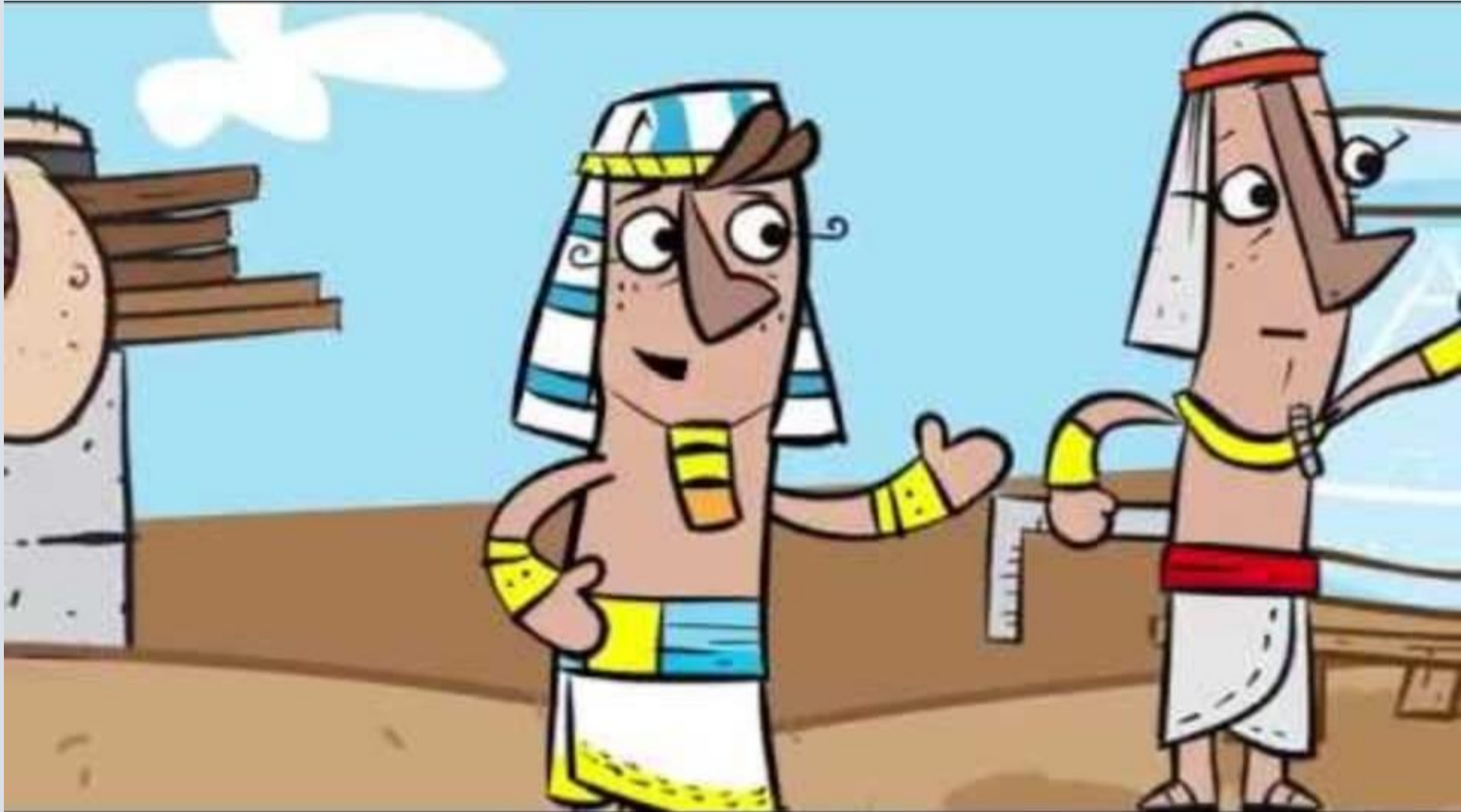
Joseph in Egypt (Genesis 39-41)