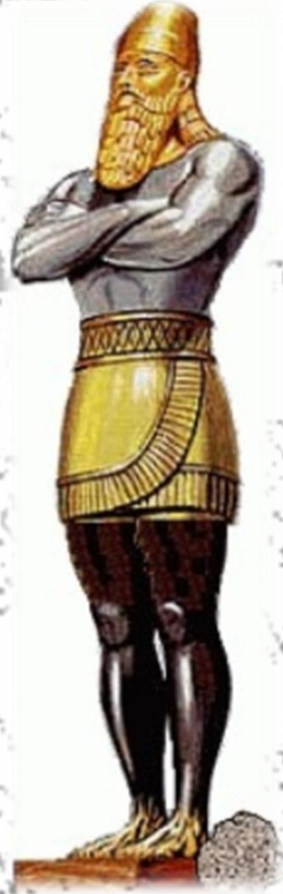
Daniel 2 : The Statue