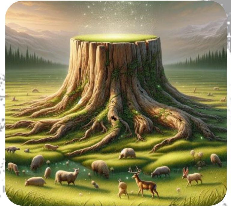
Daniel 4 : The Tree