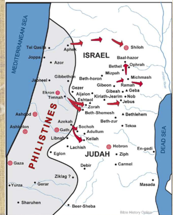
Map of Philistine Cities and Conquests