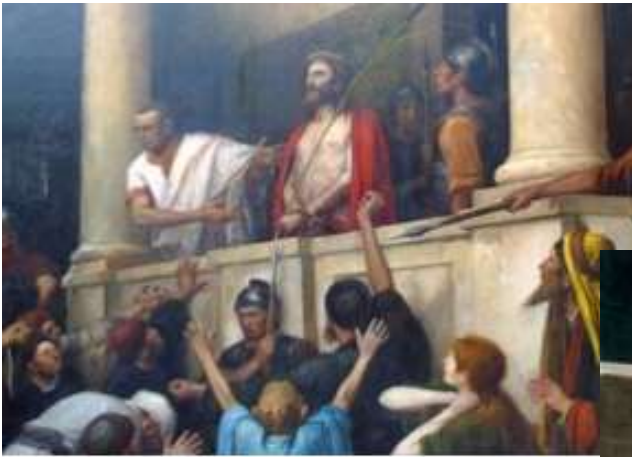
Sentenced to death