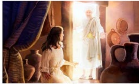
An Angel Visits Mary