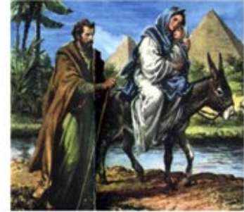
Jesus Family goes to Egypt to escape Herod